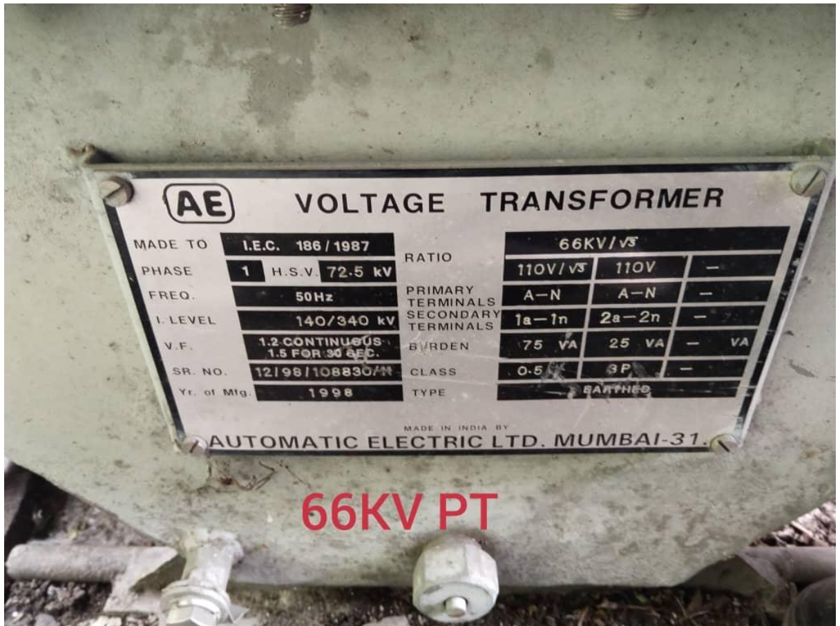
Pic: Existing 66kV PT