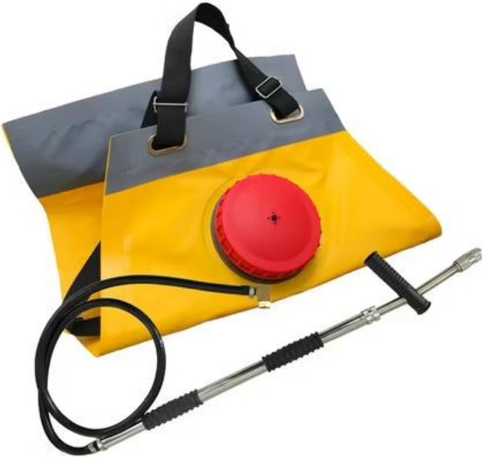
ANBEN FIRE Hand Pump 20L Fire Extinguishing Backpack Forest Firefighting Sprayer