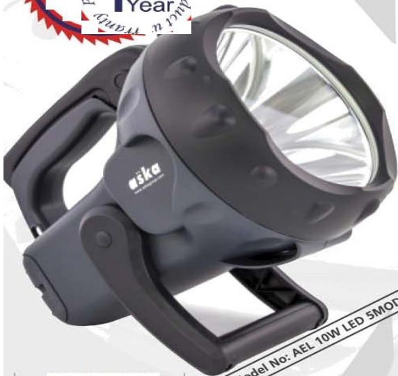
Model No: AEL 10W LED 5MODE