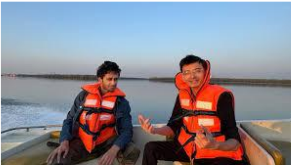
Life Jacket with reflective tape